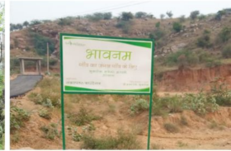
Rolled out Project Bhavnam at The Aravallis Range