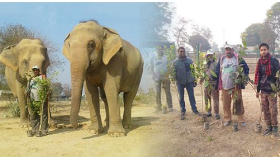
Planted trees for elephants in Agra