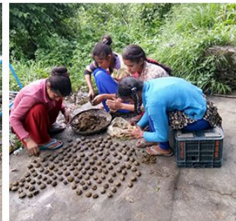
Spreading greenery in far-flung regions of Uttarakhand Himalayas with seed bombing