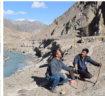
Rooted healthy saplings on banks of River Indus in Leh Ladakh