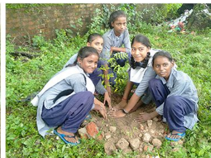
Mobilized more than 3,000 students with TATA Power