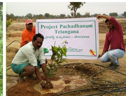
Stepped towards greenifying Telangana