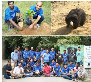
Plantation at Bannerghata Bear Rescue Centre in Bangalore