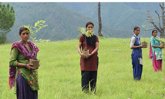
Initiated the use of organic cocoons in Uttarakhand as a pilot project