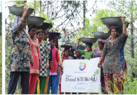
Planted trees under Project Dettol SiTi Shield with RB