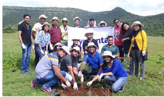
Planted more than 160,000 trees with 30 corporates across India