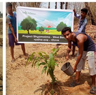
Launched Project Shyamolima in West Bengal