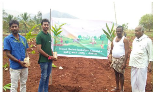
Pioneered Project Hasiru Sankalpa in Chikmagalur, Karnataka