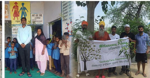
Added Madhya Pradesh & Punjab to our green list