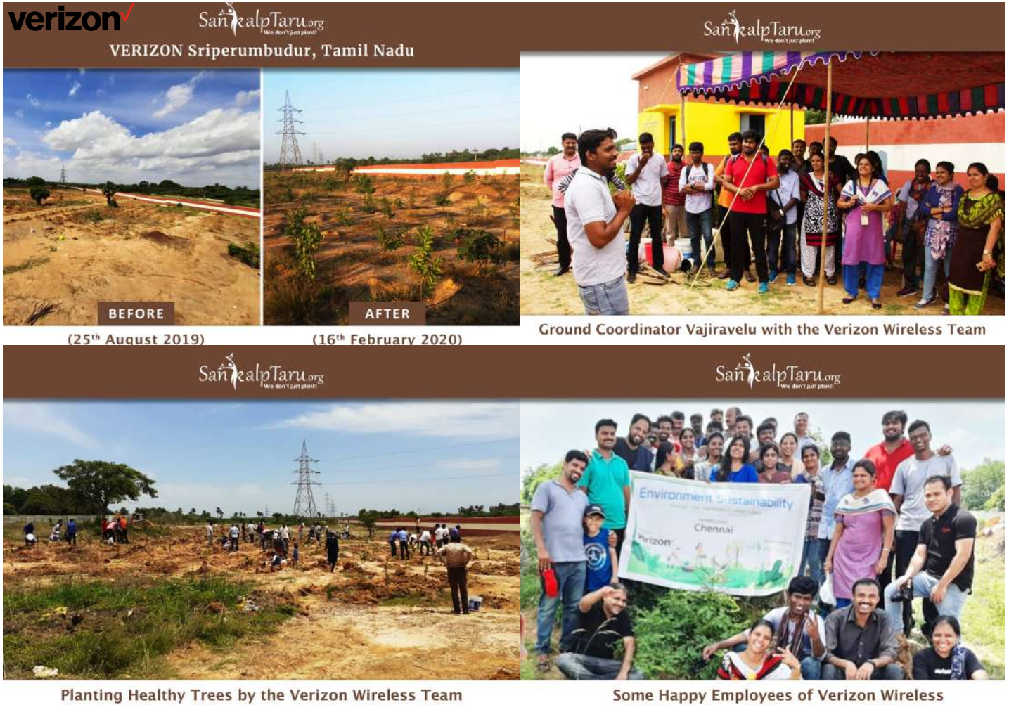
(25 th August 2019)

Verizon Wireless initiated a city-based plantation campaign with the SankalpTaru Foundation at Sriperumbudur in Tamil Nadu. The residents of the city will now breathe cleaner air as a result.