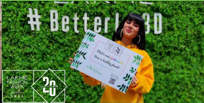
Visitors interacting with our signs at Lakmé Fashion Week.