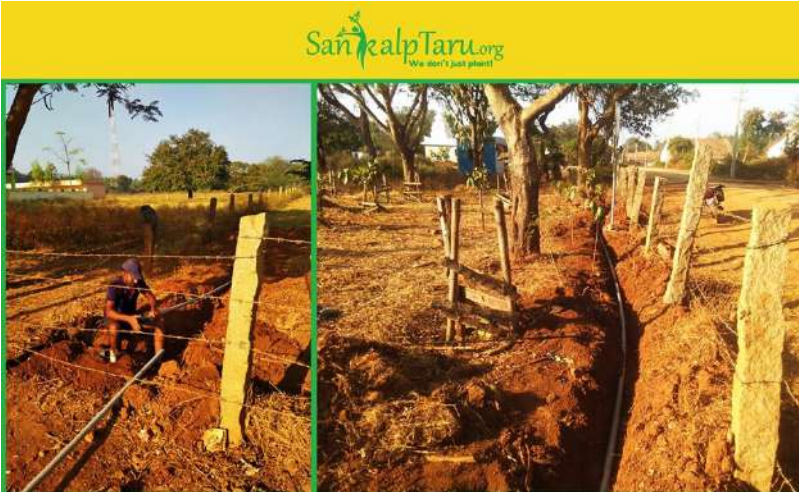
Installing a drip irrigation system for 100 plants in KMS Government High School, Balliganur village in Karnataka.

Students from KMS Government High School in Balliganur village, Chikmagalur district in Karnataka went on holiday and couldn't look after their plants. The SankalpTaru Foundation aided the students' efforts by installing a drip irrigation system for the 100 saplings that we planted last year.