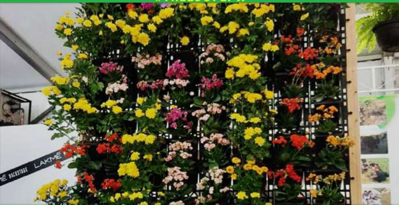
The selfie spot at the SankalpTaru Foundation stall.