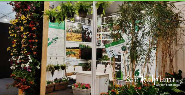
A lush landscape in the heart of the frenzy at Lakmé Fashion Week.