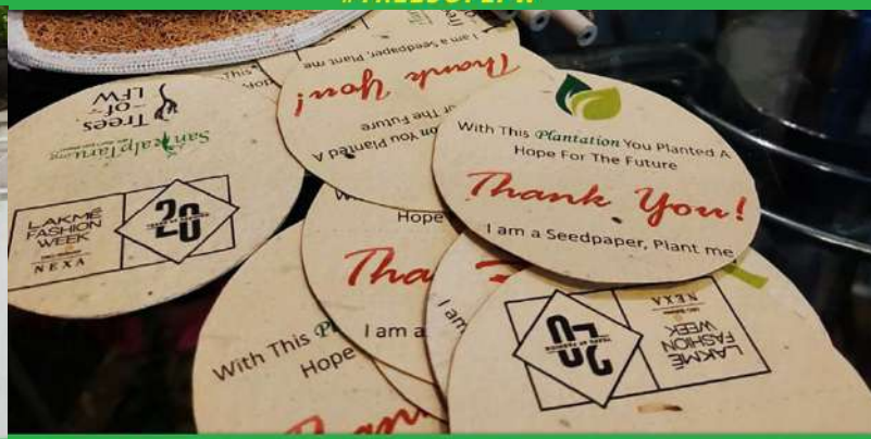
Seed paper coasters for our green champions at Lakmé Fashion Week.